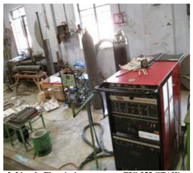
Figure 2 Lincoln Electrical square wave TIG 355 GTAW machine