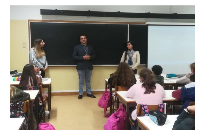
Fig.23 Higher Education Students' Intervention© padrão 2020 3. The Basic Education students learned to design a project through engaging in teamwork with peers

celebration of the "Cities for Life Day" on November 30<sup>th</sup>, whereas the 1<sup>st</sup> year students of Basic Education painted a mural in Deão rural village. The 3<sup>rd</sup> year students of Basic Education also visited formal and non-formal educational venues where they presented and discussed human rights in collaboration with International Amnesty [Fig.23].