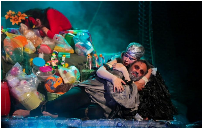
Fig. 10PlastikusArtistikus KRISÁLIDA © cardoso 201

The students received the visit of different guests in order to talk about different experiences in terms of production of artistic events. They also visited theatres, and observed rehearsals of shows (Fig.10), talked with artists and collaborated with different people in the organisation of cultural and artistic events.