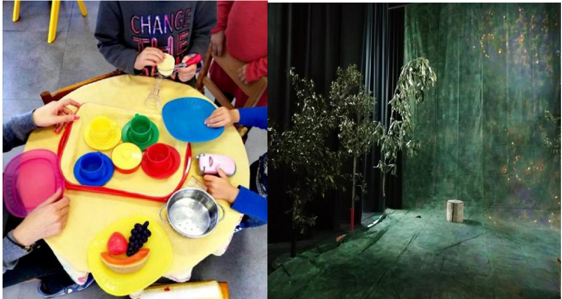
Figs. 19 & 20 Plastic Expression activities at ACEP