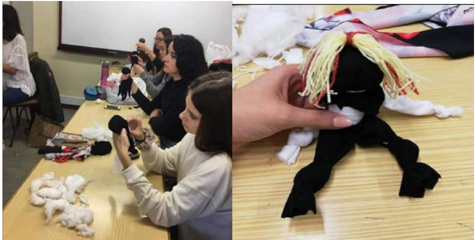
Figs. 17 &18 Creation of rag dolls at ESEVC

Students were invited by the Cultural and Popular Education Association (ACEP) to collaborate in the preparation of a scenario for a Christmas show and the promotion of artistic expression activities with children who during the week attend workshops in this institution. ACEP visited ESE and promoted a workshop that showed how to create rag dolls with which our ancestors used to play (Figs. 17 -22).