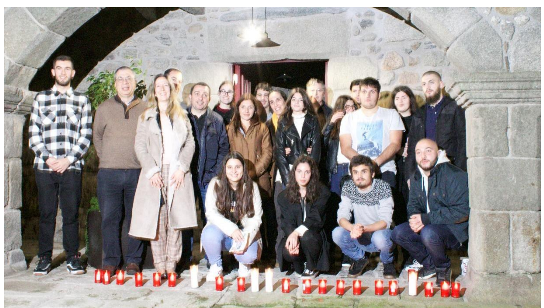
Fig. 12 HES, teachers, International Amnisty and AJDeão