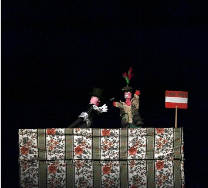
Fig.13 HES, teachers, Krisálida at MALUGA Puppet Festival