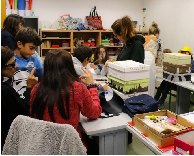
Fig.1 Shadow Theatre at ACEP