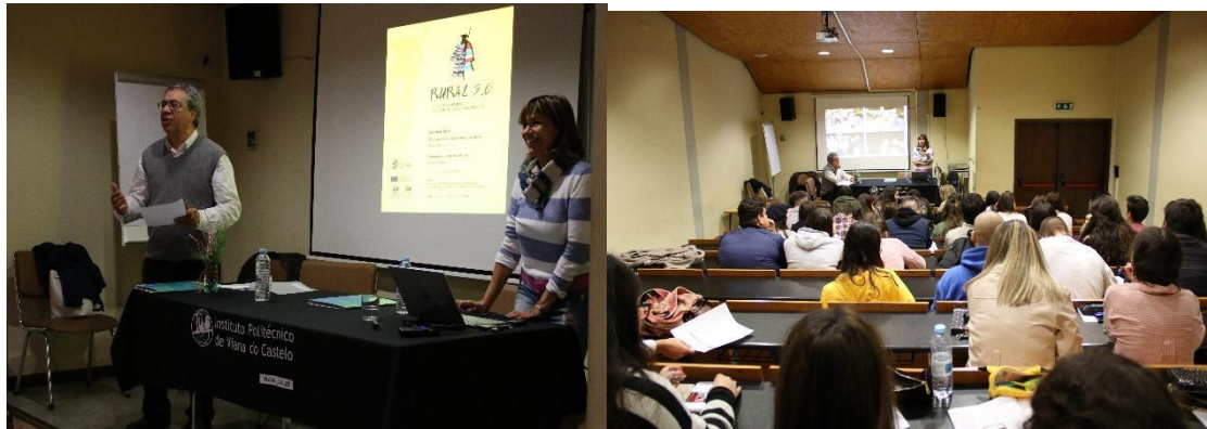
Fig. 3 & 4 From Migration to Rural Development © moura 2019

The concepts of Culture, Identity and Human Rights were addressed, and two more organizations were introduced- International Amnesty and AjDeão . The third training session was moved to Monday afternoon as many students began to complain that the wednesday afternoon was not convenient for them. The issues of migration and rural development were discussed by two sociologists, one a member of the Town Hall and the other a member of staff of the Rural 3.0 project (Figs. 3 & 4).