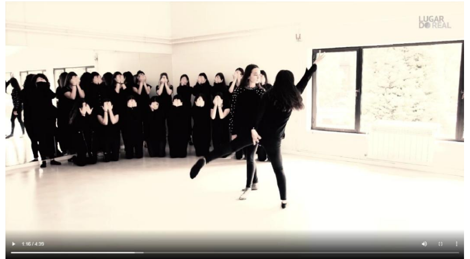
Fig. 6 Cine Poetry project- addressing social issues

can lead to the transformation of everyone involved. The collaboration with Ao Norte Association (Cine Club), through Cine Poetry project, helped students to understand image analysis as a pedagogical tool when addressing social issues (Fig. 6).