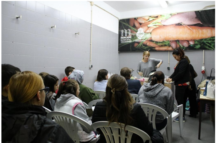
Fig.5 Municipal Market

The four projects described here were carried out by art teachers working at Escola Superior de Educação, Viana do Castelo Polytechnic who implementedRSL approaches in the rural context of Minho, Northern Portugal. The projects included students from different art subjects enrolled indifferent courses, such as Vocational Diplomaof Arts and Technology (Light, Sound and Image);Vocational Diploma of Education Intervention in Kindergarten; and Basic Education Degree. In so doing, it reflects on commonalities in the way art teachers conceptualise and operationalise educational RSL as well as methodological issues.