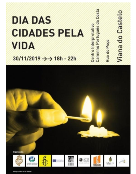
Fig. 11 Poster designed by the students