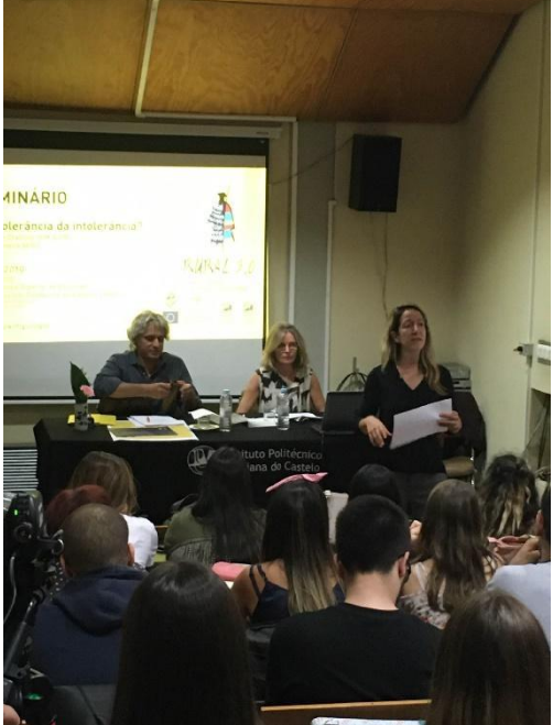
Fig.2 Intolerance of the Intolerance © moura 2019

Building Bridges: Experiential Service-Learning Understanding atViana do Castelo Polytechnic