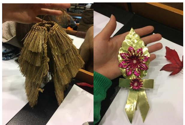
Figs 15 & 16Croça and palmito

The last stage of the activities developed with these students involved drawing and painting related to the characterization of traditions, legends, artefacts and forms of playing in the past and present, at the rural community of Deão. All the artistic studies were transferred to the walls of a container and a wall next to the