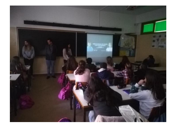
Fig. 25Abelheira Basic Education School, Viana do Castelo © brito, January 15th 2020.

competencies, such as the ability to analyse and organize information, creativity, teamwork, autonomous learning, the ability to work in different social contexts, more specifically the gipsy community. (AB, 2020)