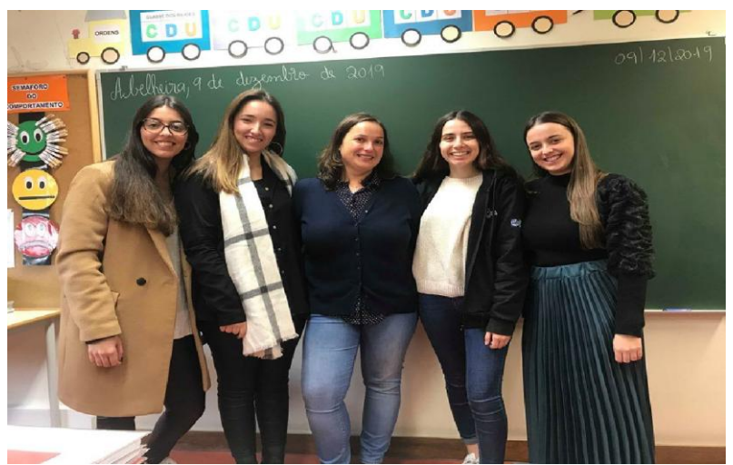
Fig.24 A class at Abelheira Basic Education School