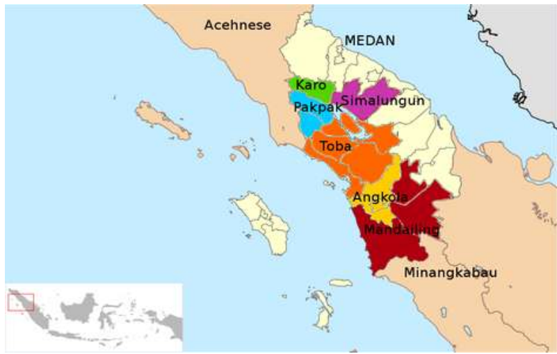
Fig. 1. Ethnic group in North Sumatera.

Indonesia is one of the countries that rich of culture. One of Indonesia's diversity is shown through the variety of foods that characterize every tribe from Sabang (the westernmost part) to Merauke (the easternmost part). Batak is one of the names of tribes inhabiting the area of North Sumatra, but there are also inhabit in the border region of Aceh and West Sumatra. The majority of Batak people inhabit in many regions, such as: Karo Highlands, Langkat Hulu, Deli Hulu, Serdang Hulu, Simalungun, Dairi, Toba, Humbang, Silindung, Angkola, Mandailing and Tapanuli district.