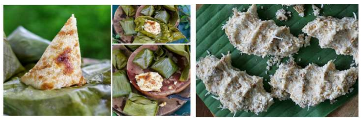
Fig. 2 . Traditional Food from Batak. [A] Ombus-ombus. [B] Pohul-pohul.

In the past, Ombus-ombus was not sold but only served in traditional ceremonies Batak society. Raw materials also related to abundance of materials around them. Limited knowledge makes Batak society think to look for alternative foods other than cooked rice, which is processed snacks from rice flour (Rytha Tambunan, October 27th 2017, personal communication). Batak society has a tradition of musicalization all things that related to its culture. Records of history or local wisdom that become a tradition has been told through the song. Likewise with ombus-ombus, the society considers that ombus-ombus is the identity of Siborongborong city. With a sense of pride, the people of Siborongborong create a song that tells about ombus-ombus. The song entitled "Marombus-ombus" has the meaning that we are doing something about Ombus-ombus. Messages delivered from this song are Ombus-ombus from Humbang District, which tastes sweet, and served hot. In this song also tells the story of Sihombing family, a person who is good at making Ombus-ombus. There is also a message if you want to get a wife who can cook Ombus-ombus perfectly, Go to Siborongborong city and marry "Boru Sihombing" or women with "Sihombing" clan in Batak society (Mauly Purba, October 27th 2017, personal communication).