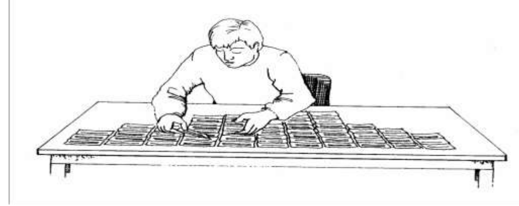
Figure 1. Q-sorting