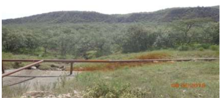
Plate 1: Leaking steam gathering system