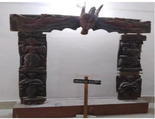
Fig: 4 -wooden door frame