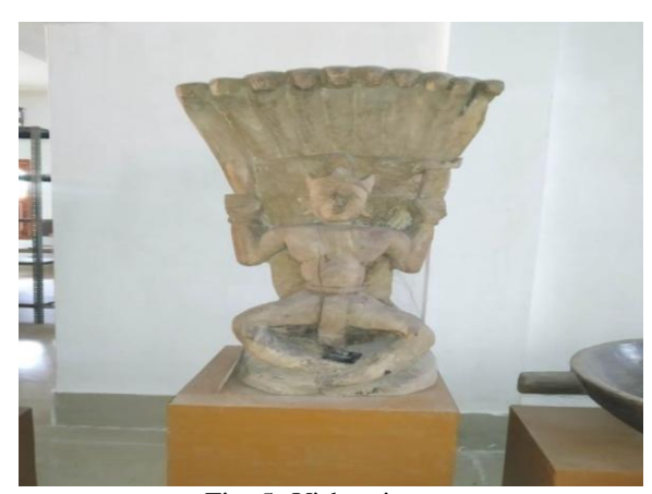
Fig: 5- Vishnu image