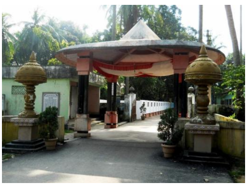
Fig: 1 Toran (Gate) of Norowa satra

1 TORAN: There are two gates or "Batsaras" (torans)on two sides. They are the Toranas of Norowa satra and Salaguri satra respectively. The main entrances to the Thaan are on the eastern side of the compound at Narowa and another from the southern side of the compound at salaguri, each toran or batsora are curved with sculptural representation of Vaishnava culture