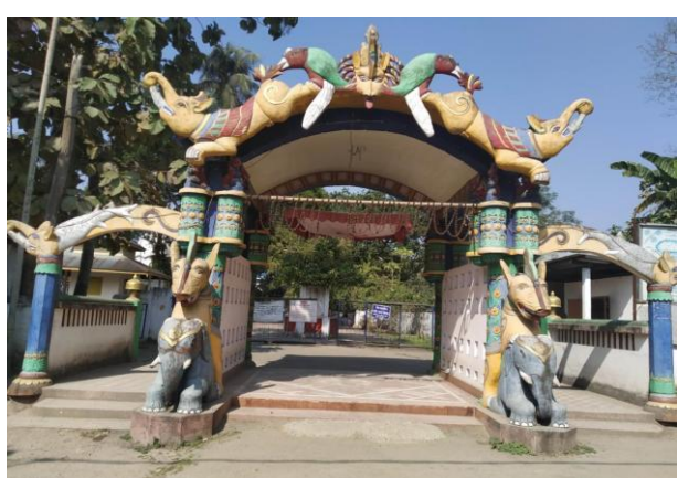
Fig: 2 Toran (Gate) of Salaguri satra

2 KRITANGHAR: In the middle of Bordowa thaan complex the great kritanghar (mandapa) is located. It was actually made by Sankardeva. The original kritanghar was replaced by one Assam type Building measuring 180ft. length and 85ft. breath with an attached Monikut in 1958. It can be noted that though modern technique is applied at the time of reconstruction of the kritanghar yet the traditional style of same is also maintained to some extent. A large number of bhakts, jatris visit Bordowa thaan and join the daily nam prasanga (prayers) in kritanghar. The main entrance of kritanghar is known as "Sinhaduar".