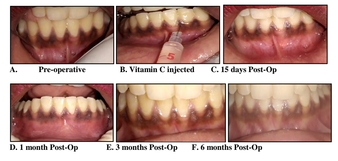
Figure 2: Treatment with VITAMIN C