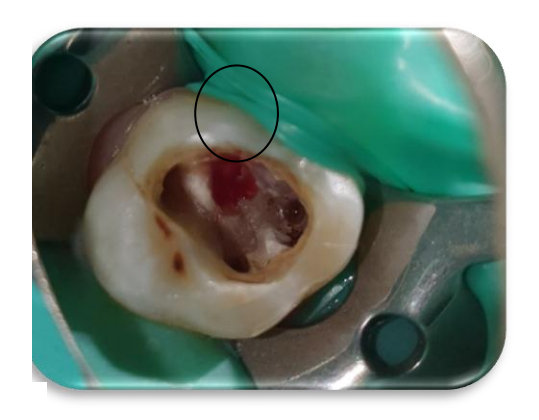
Fig 2 Perforation

Endodontic treatment was initiated under rubber-dam isolation. During access opening pulp stone in pulpal chamber was removed. Two calcified canals were negotiated that is mesiobuccal canals and distobuccal canals and an iatrogenic perforation was created during the negotiation of palatal canal (fig-2). During the calcification of the tooth the palatal canal gets shifted to the palatal wall area and so a perforation was created in attempt of negotiating the palatal canal.