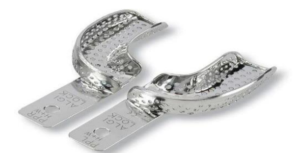
Figure 2:-Partial stock trays right and left

Usually the first step after initial examination and radiographs is to obtain the diagnostic cast. Several studies done in this aspect have recommended using partial stock trays for right and left halves of the arch. The first cast is placed into the second impression prior to pouring, to obtain a cast of the complete arch. <sup>3</sup>