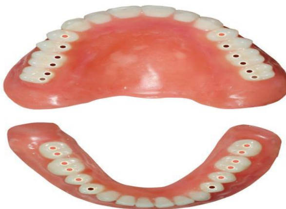
Fig 2- Centric occlusal contacts in lingualized set up