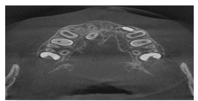
Fig.2;Supernumary tooth in the palatal of the root tooth

According to one theory, mutant genes give rise to supernumerary teeth and this is supported by the finding of increased supernumeraries in patients with facial & dental anomalies such as cleft lip & palate. The development of bilateral supernumeraries also suggests that they may be controlled by a mutant gene. The importance of heredity is emphasized by the increased number of supernumerary teeth found in relatives of those affected.[11-15]