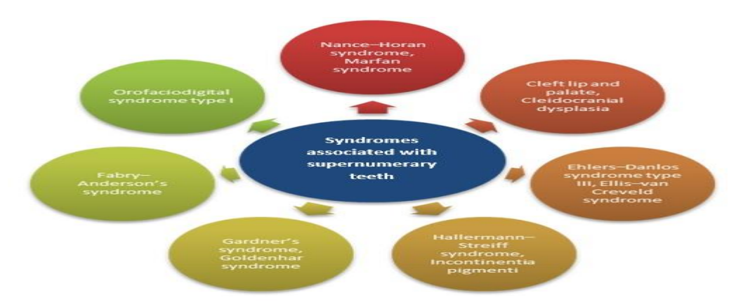
Table.1;Syndromes associated with hyperdontia

Supernumerary teeth may be present in any area of the dental arches but usually, are seen in the maxillary anterior region. The exact etiology of supernumerary teeth is not completely known, but various theories have been put forward which include dental lamina hyperactivity theory, the dichotomy of tooth bud, atavism theory, heredity, and environmental factors. According to dental lamina hyperactivity theory development of supernumerary teeth is the result of local, independent and conditioned hyperactivity of dental lamina2. This is the most accepted theory.[4,9,10]