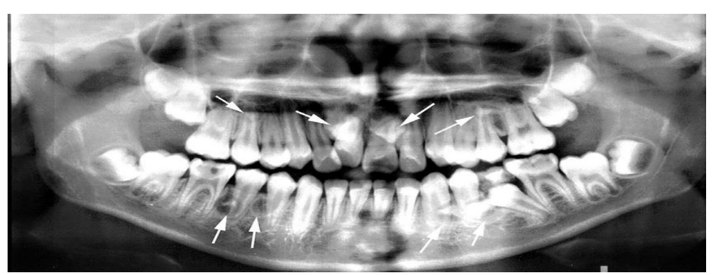
Fig.1;Panoramic view of nonsyndrome multiple supernumerary teeth:

Permanent (secondary) teeth develop from the successional dental lamina associated with the primary (deciduous) tooth germs, and their budding starts during the cap stage of primary tooth development. Also posterior molars form in succession from the dental lamina at the distal aspect of the previous molar. Both the primary and successional dental laminae contain stem cells which have the capacity to form teeth. Sox2, a known marker gene of stem cells, is expressed in the primary as well as successional dental lamina .[3,4]