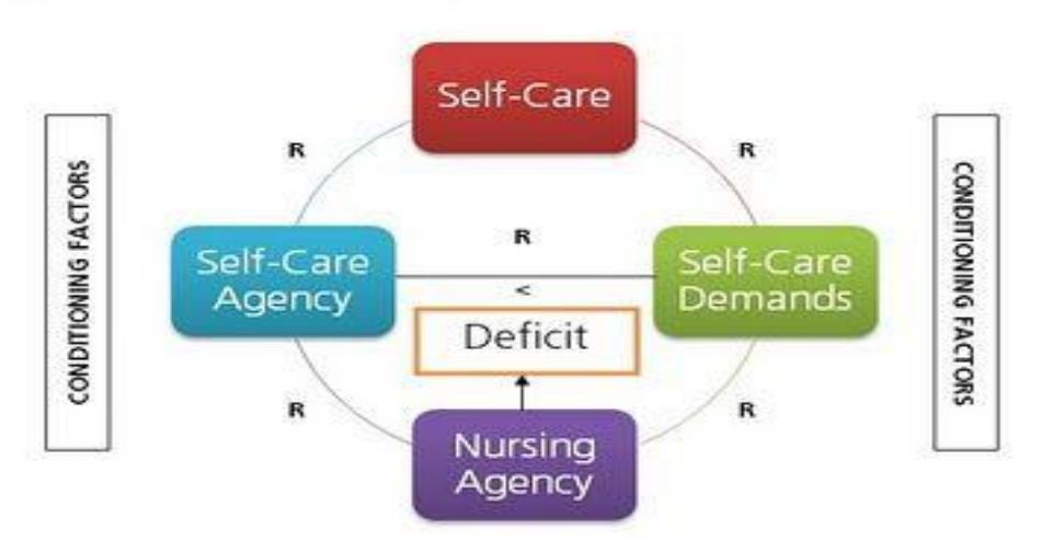
Figure 2.2: Conceptual Framework of Dorothea Orem's Self-Care Nursing Theory (Orem Model of Nursing) (adapted from de Lara, 2010)