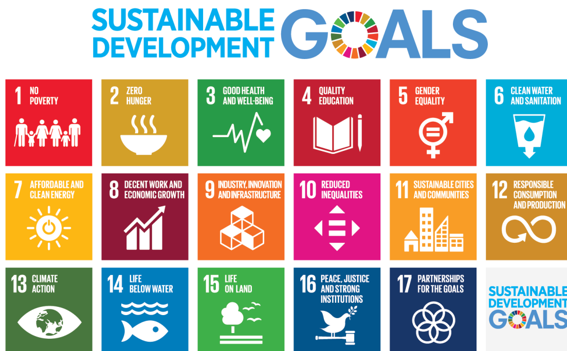
Figure 2. The 17 Sustainable Development Goals (SDGs) adopted by the United Nations as part of the 2030 Agenda for Sustainable Development (United Nations, 2015).

As a component of the United Nations (UN) 2030 Agenda for Sustainable Development, all member states of the United Nations accepted the Sustainable Development Goals (SDGs) as a universal framework in 2015. The SDGs offer a common road map for achieving environmental sustainability, prosperity, and peace by 2030. In an effort to create a more prosperous and sustainable world by 2030, the Sustainable Development targets (SDGs), which are made up of 17 interrelated targets, aim to address a wide range of global issues, such as poverty, inequality, degradation of the environment, and social inequalities.