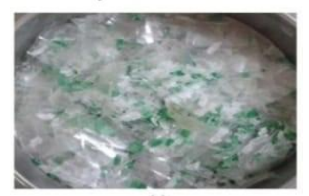
Figure 8: Plastic

Plastic is utilized as coarse aggregate in concrete mixes, discarded plastic waste showed enhanced compressive strength and workability. PET bottles were shred and crushed at a plastic recycling factory to a small fraction and then washed to get rid of unwanted objects and the oily texture. PET bottles were collected from a disposal place. PET aggregate have specific gravity 2.5, coarse aggregate size is 19 mm.