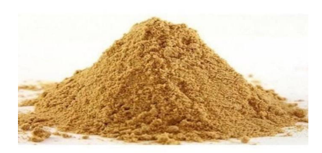
Figure 1: wood chipping and wood powder