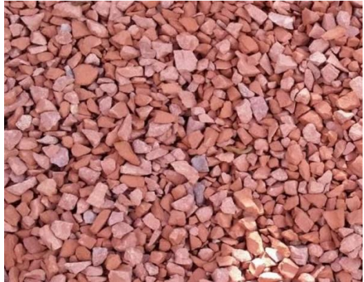
Figure 3: Low – quality crushed brick aggregate