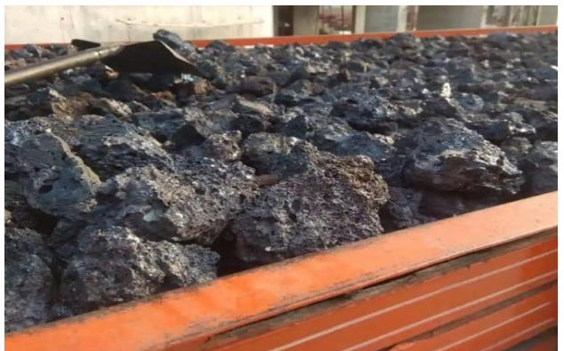
Figure 10: Steel Cinders

Steel cinders from steel companies have been used in place of coarse aggregates in some areas. These steel cinders are less in weight, the research uses steel cinder as a replacement for coarse material to fulfil the required grading in manufacturing concrete. Steel cinder passing through a 30 mm sieve and is retained on a 20 mm I.S sieve. Due of the mineral structure, the surface of the steel cinders is usually rough and porous and are physically viewed as angular materials that can be used in substitute of coarse aggregate in some applications. The steel cinder aggregates would be lighter and having a specific gravity of 2.05.