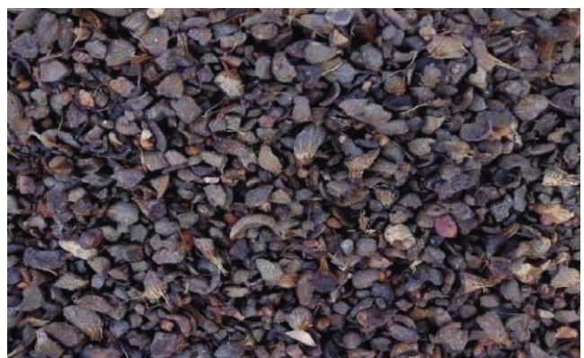
Figure 4: oil palm shell

OPS found in Africa, China. The second-largest producer of palm oil is Malaysia. Oil palm shell (OPS) is the most typical agricultural waste in the palm oil industry. The specific gravity and water absorption over 24 hours of oil palm shell are 1.2 and 20.5% respectively. The OPS aggregate weighs between 500 and 600 kg/m<sup>3</sup>