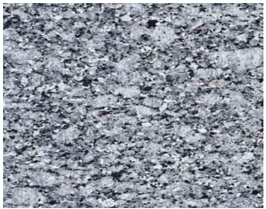
Figure 2: Granite

Nowadays, there is a significant increase in the quantity of granite powder due to the increased use of granite stone products, which has negative social and environmental effects. A type of igneous rock called granite is created when magma beneath the earth's crust crystallises. When granite stoneware is cut and polished in quarry industries, which total between 250 million and 400 million tonnes annually, granite fine powder is produced as a by-product. The granite sludge/waste (GS) used was obtained from filter pressing machines of the granite processing plants. This granite is obtained from the process of transforming raw blocks into slabs, up to 80 % of the granite rock is being wasted, according to Brazilian Association of companies Brazil was the third largest exporter of granite in the world (2017). In order to reduce the pollution and promote economic standards we can use this granite fine powder (GFP) as a replacement of fine aggregate in lightweight aggregate concrete and this residue improves workability, granite residue has greater water absorption unlike sand due to its microstructure Additionally, replacing granite residues with natural aggregates results in a decrease the percentage of air added to the mixture.