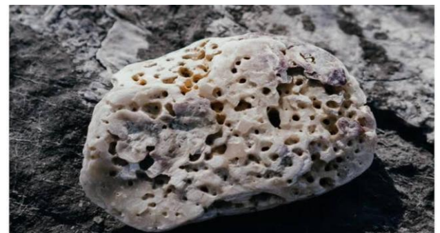
Figure 6: Pumice

can be imported around 3 to 4 million tonnes annually, and the turkey and Italy produces large amount of pumice. Pumice aggregates have specific gravities of 1.68, 1.18, 0.98, and 0.92 for sizes 0-2, 2-4, 4-8, and 8-16, respectively. To ensure that the qualities of the pumice aggregate do not alter before production stages, it should be kept in closed storage rooms; the water absorption rate of pumice (lightweight aggregates) is quite high.