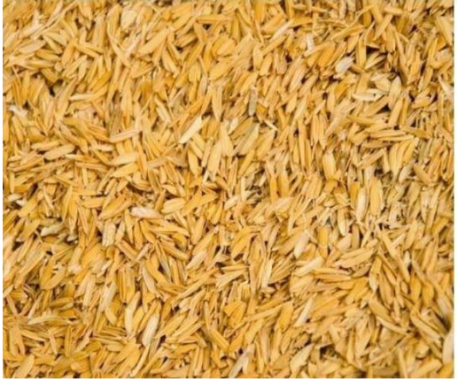
Figure 9: Rice Husk

utilised while creating bricks, which results in more porous bricks that provide higher thermal insulation. Rice husk is used to make high-quality steel because of its excellent insulating qualities, which include low thermal conductivity, a high melting point, a low bulk density, and high porosity. Additionally, it is used to coat the molten metal in castings and tundishes, which operate as excellent insulators and prevent the metal from cooling quickly.