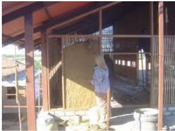
Image 3. Wall construction Khamir- Kutch Infill of wattle and Daub panel by local community in steel framework