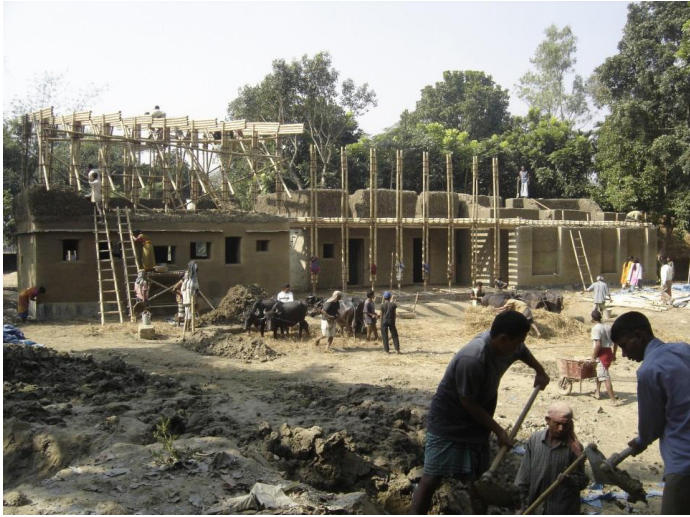
Image 11. Mud as the primary material for METI School- Bangladesh Mud as the primary material that involves community participation, easy maintainance and construction

Anna focuses on how it is important to realise that all over the earth mud had always been one of the indigenous techniques of construction. Mud being an inclusive material allows for people of all kinds and ages to be a part of the construction process. Anna's work explore and use architecture as a medium to strengthen cultural and individual confidence to support local community economies and to foster ecological balance. (Anna Heringer,n.d)