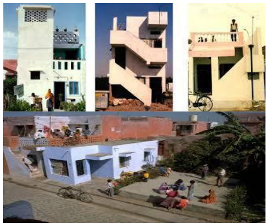
Image 7. Incremntal Aranya Housing- Indore (Top) Incrementaion as per the need of family and availability of money(Bottom) Resident participation in the making, choosing from the kit of parts available

Doshi kept in mind the importance of neighbourhood for the people and therefore kept no physical wall demarcating the entry and exits, extending families far and beyond. Public life could seep into the living space. For Doshi, designing homes required thinking of the spare time he residents had. Clusters of 10 houses were formed at the planning level that opened in a street. The backside of each house were like courtyards, open space for play and service areas.