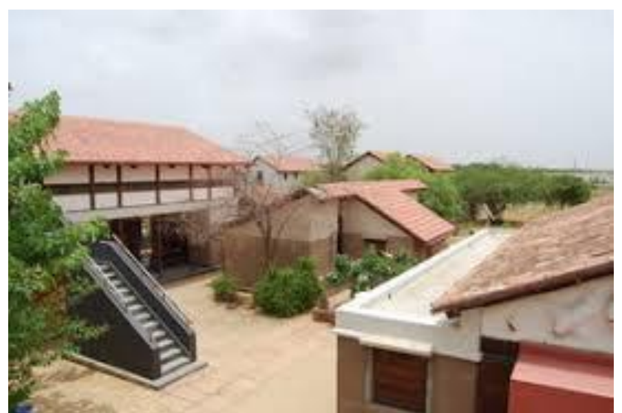
Image 1. The Khamir Resource Craft Centre-Kutch View showing the intermingled ecology and structure

Using local materials and appropriate construction techniques the architect successfully involved the community