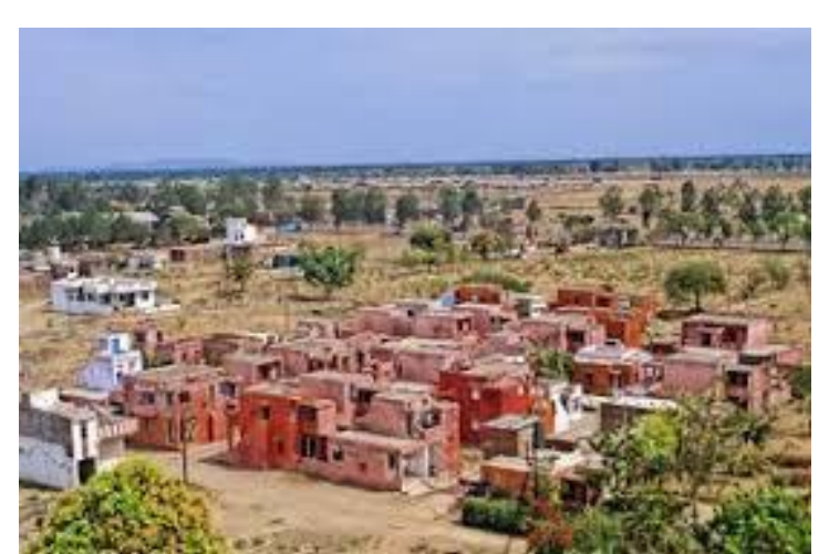
Image 5. Aranya Housing- Indore View of the 80 model houses by the architect

In 1989, the Vastu Shilpa Foundation was entrusted with the task of preparing a master plan with innovative options to develop a township in Aranya. Its main objectives were to create a new township with a sense of continuity with the existing settlement patterns by providing a good living environment.(Serageldin,1997, p 105) The Aranya Housing Project was for the EWS group of the society and was based on a participatory approach. The planners and architects had planned the whole scheme from the financial to the structural level and created a kit of parts. This kit had detailed drawing of each segment from which the residents could choose and construct their houses. 80 Model brick houses or prototypes of one, two and three stories were built for demonstration showing various layouts. This acquainted Aranya's residents with the techniques, building systems, materials and structures.