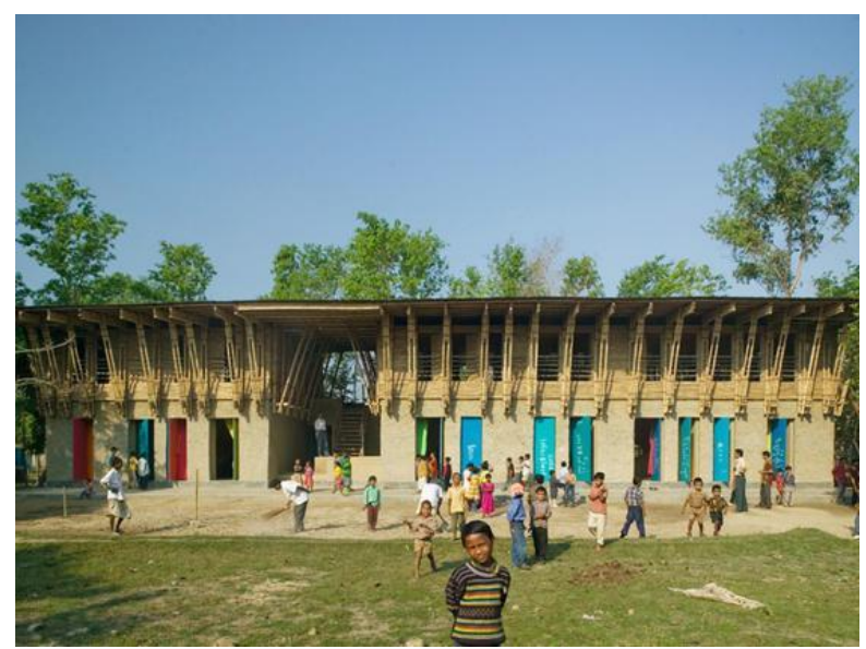
Image 9. METI School- Bangladesh Front Elevation depicting material usage

Anna Heringer believes that the most sustainable strategy for sustainable development is to cherish and use your very own resources and techniques and not depend on external factors(TED, 2017). The METI School, in Rudrapur Bangladesh was built by Anna and two NGO's Shanti and Dipshika funded the construction of this unique building. For the School, Anna used sustainable material like mud that is right under the feet and bamboo that grows abundantly in the area. The community participated in the process of construction, as there was no electricity in those remote villages and human energy became essential. Moreover, communities in these areas are usually content to get work. For construction tools Anna used the water buffaloes of the community, who mixed the straw, mud and water. The METI school is made of large load bearing walls that ground the structure and a bamboo structure for the first floor that brings lightness to the structure.