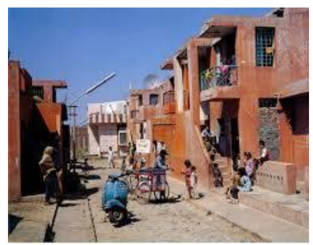
Image 8. Aranya Housing- Indore Open spaces with wide street allowing interaction between residents as well as scope for futher addition to built form