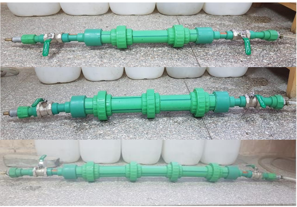
Figure (2) The Final Shape for the Filtration Unit

The experimental works were divided into seven runs. Each run had a different media type for filtration. Sand, anthracite coal, and agricultural waste are the three media types used in this study for the mono, dual and triple filtration process. First run used sand, 2nd run used anthracite coal, 3rd run used agricultural waste as a mono filtration media, 4th run used sand & anthracite coal, 5th run used sand & agricultural waste, 6th run used anthracite coal & agricultural waste as a dual filtration medias and finally 7th run used sand, anthracite coal & agricultural waste as a triple filtration media. Each run was repeated three times with different water sources that had different inlet TSS concentrations. Average TSS concentration for the first water source equal 34 mg/l, for the second water source equal 146 mg/l, and for the third water source equal 468 mg/l.