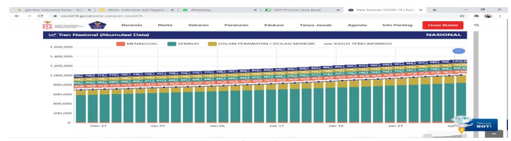
Figure 2. Covid-19 Distribution Map